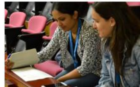
Figure 2. ACM-WE activities will be assessed from the perspectives of three enablers of professional growth, i.e., their aims and impact through providing information, encouraging development of skills, and motivating actions and initiatives.

Take action and entrepreneurial attitude underpinned by motivation, determination, organizational skills, and professional connections.